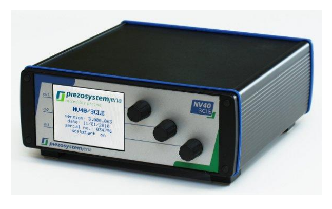
fig.: NV 40/3CLE