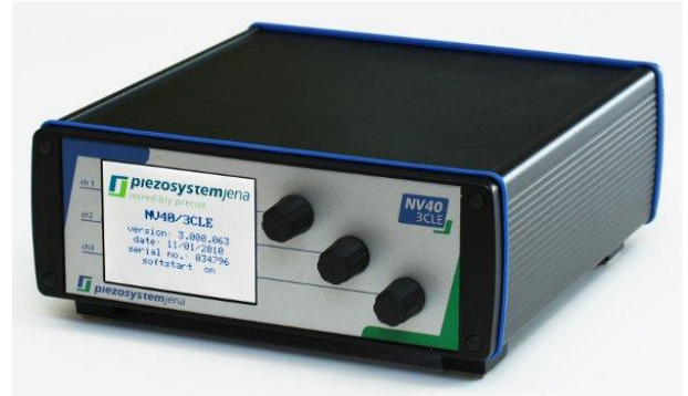
fig.: NV 40/3CLE